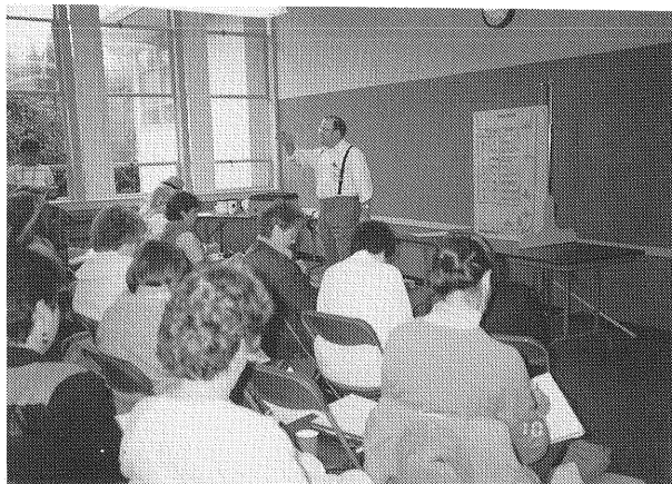
Photo 1 EVs' Workshop at a Community Center.

Contrary to the other two patterns of the curves, curves in Fig. 2(c) show a remarkable difference between the three groups. The curve of the EVs group shows very high demand for information of personal/voluntary preparedness as well as first-aid, and very low demand for government initiatives. On the other hand, the curve of the Tokyo Institute of Technology group shows high demand for government initiatives. The curve of the Stanford University group lies in-between.