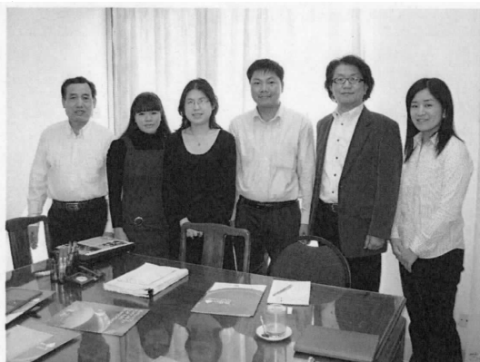
Figure 6: Meeting for Closing the internship at UN Habitat office.

With what I did for this project, both my supervisors and the host organization were very satisfied and highly evaluate my contribution. I felt that I had promoted myself to a higher level with three months being away to work as an intern for an international organization. I am sure that with this experience, it will bring me a good evaluation when I apply for the new job in the future.