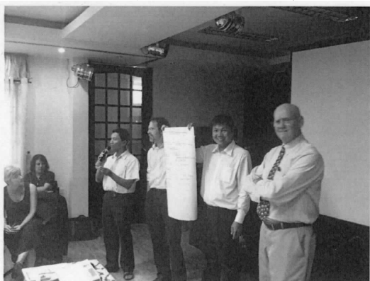
Figure 5: Presenting the discussion results

From these key issues, I generalized and revise the final project document. Finally, I successfully completed my work with an excellent evaluation result from experts and professors from the training program (See the appendix).