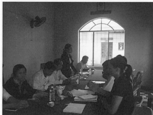
Figure 4: Working with the local organization

She focus on climate change and water resource management. My fields are more broader and they are linked to each others. Therefore, I need to collect as much information as I can and systemize them during the analysis phase.