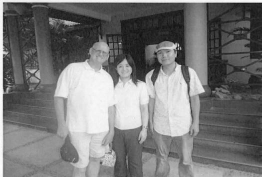
Figure 1: Arrival and Figure Start a new job

After safe arrival to the project site, I start to to familiar and explore the new place in cluding accomodation, foods, and personal stuffs. I felt like refreshing here and enjou a lot with the new city where I based for my internship. Foods are delicious and people are very friendly. These things made me work more effective and concentrate. I felt the time become shorter for me and I did not feel homesick because I did a lot of communications with my family.