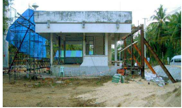
Figure 3. Experiment set up for the lateral load on RC building

Consequently, corresponding maximum current velocity and inundation depth will be estimated using a design equation for tsunami wave force and current velocity (Okada et al., 2006). Finally, the obtained tsunami features (inundation depth, current velocity and hydrodynamic force) will be presented on the developed tsunami fragility curves in Thailand (Suppasri et al., 2011).