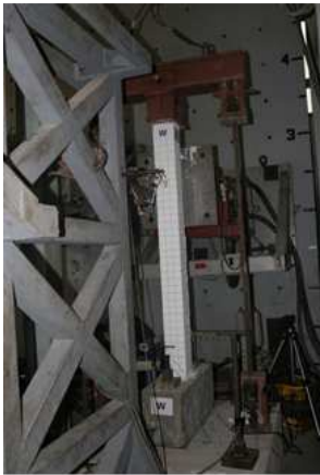
Figure 2. Experiment set up for the lateral load on RC column

3. Methodology: This study applies analytical method to estimate the structural performance against the 2004 tsunami of RC column and building. The maximum lateral load resistance force was obtained from the full scale experiment on RC column at laboratory as shown in Fig. 2 (Foytong, 2007) and RC building at tsunami inundated area in southern Thailand as shown in Fig. 3 (Lukkunaprasit et al., 2010).