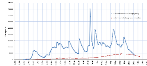
Figure 2. Comparison of Simulated and Observed Maximum Daily Discharge of the Chao Praya River at Station C.2 during year 2011

This means that 1K-FRM is only routing model without considering any losses. Thus we have to develop the model by combining the model with water balance model, reservoir simulation model as described in the methodology.