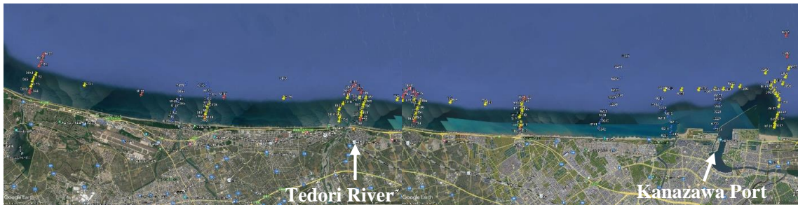
Figure 1. Location of sediment sampling points plotted on Google Earth

Sediment sampling was conducted in October 2020 and September 2021 along 40 km stretch of the coast from Shinbori River mouth to Uchinada coast. As shown in Figure 1, the sampling points between 5 to 22m in depth are located in the left and right areas of the Tedoru River mouth. In the longshore direction, samples were taken at the depth of 15m along Ishikawa coast, and at the depth of 22m along Kanaiwa coast.