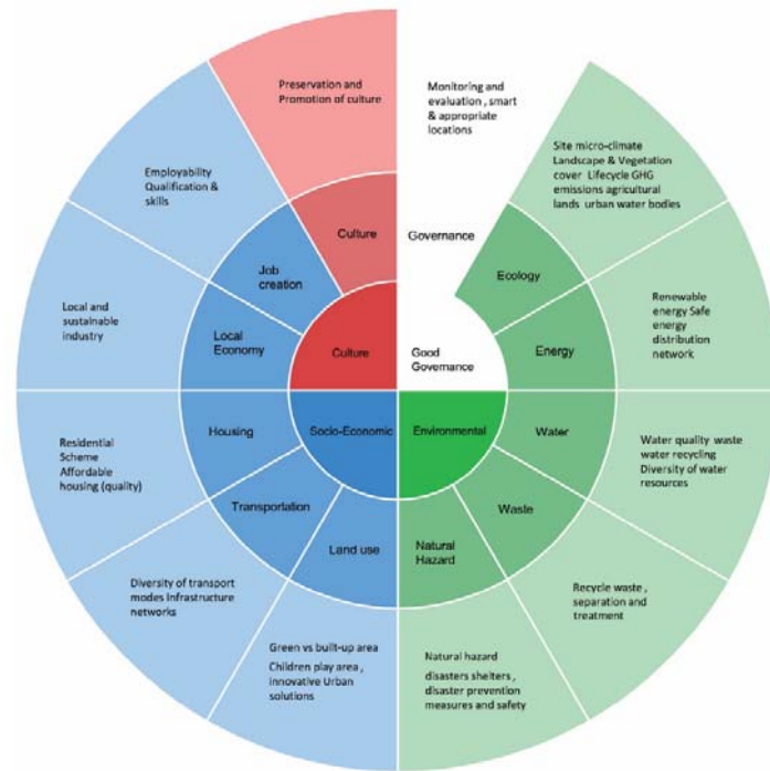
Figure 2: Proposed Sustainability chart

cause of differences in priorities for urban development (6) .