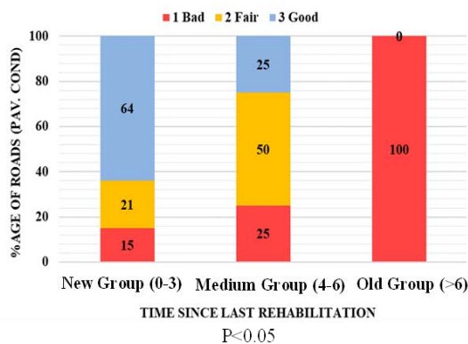
Figure 2 Results of cross-tabulation analysis of pavement condition with age

The p-value obtained from the Chi-square test was found to be less than 0.05 revealing that the pavement condition has an association with age. Whereas from the cross-tabulation analysis, it was found that the process of degradation of pavement was already been started at about three years as more than 30% of roads were in fair to bad condition. The percentage of good condition roads was further reduced from 64% in the new group to just 25% in the medium group, whereas the percentage of roads in fair and bad condition increased in the medium group, indicating that the pavement condition is deteriorating with time. Similarly, no good to fair condition roads was found in the old group showing that the pavement condition gets completely deteriorated after 06 years, which may result in huge rehabilitation costs.