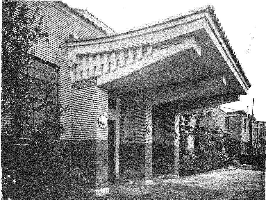
(4) 同上 西側入口の景